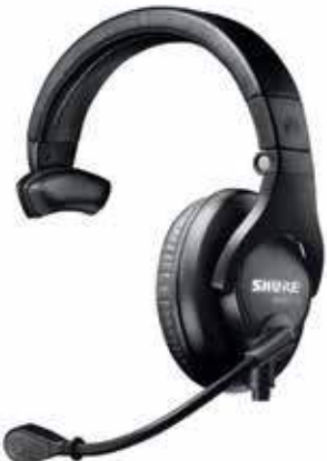
BRH441M Single-Sided Broadcast Headset