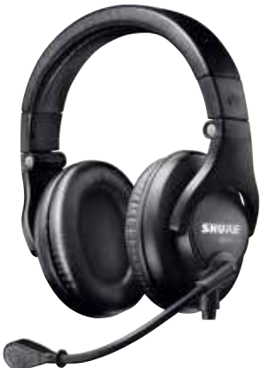
BRH440M Dual Sided Broadcast Headset