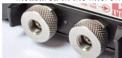
Type of RF Port(KC908A/B)