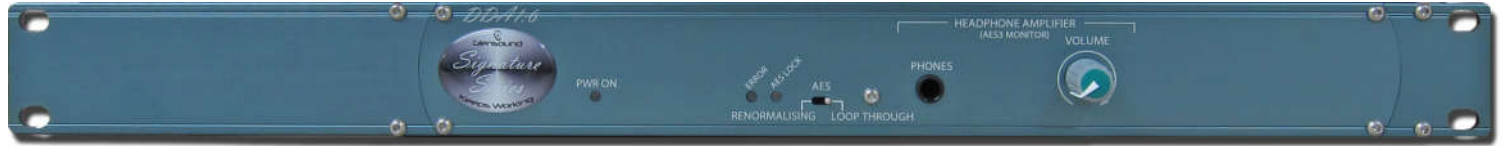
DDA 1:6 Front