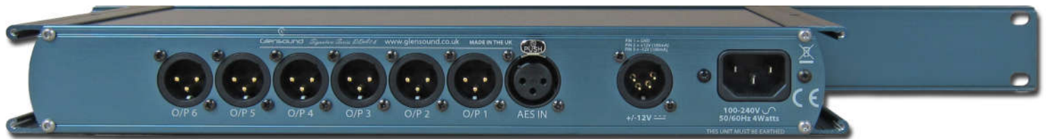
DDA 1:6 Rear