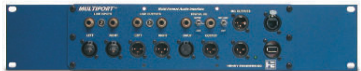
Shown with rack-mount adaptors, included.