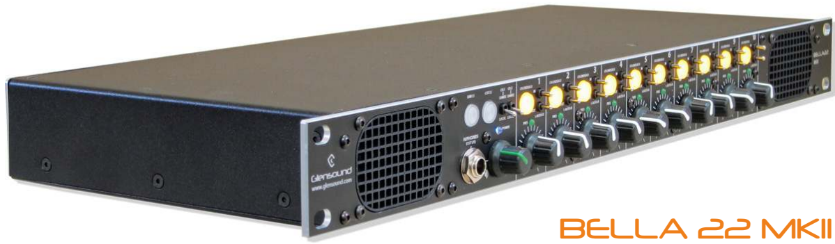
BELLA 22 MKII