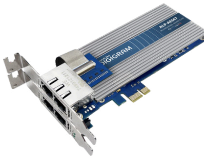
Low Profile 4 Eth ports