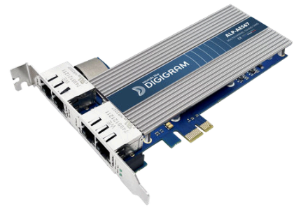
Full-height Profile 4 Eth ports