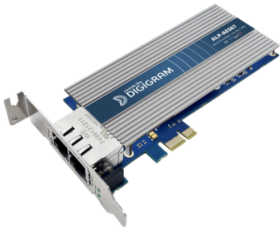
Low Profile 2 Eth ports