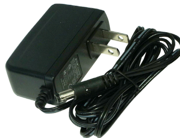
6 ft., AC to DC Adaptor (12VDC)