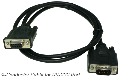
3 ft., 9-Conductor Cable for RS-232 Port