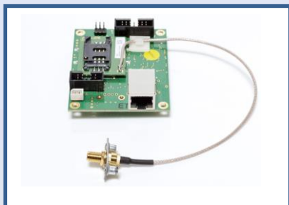
Web server – Web server + GSM